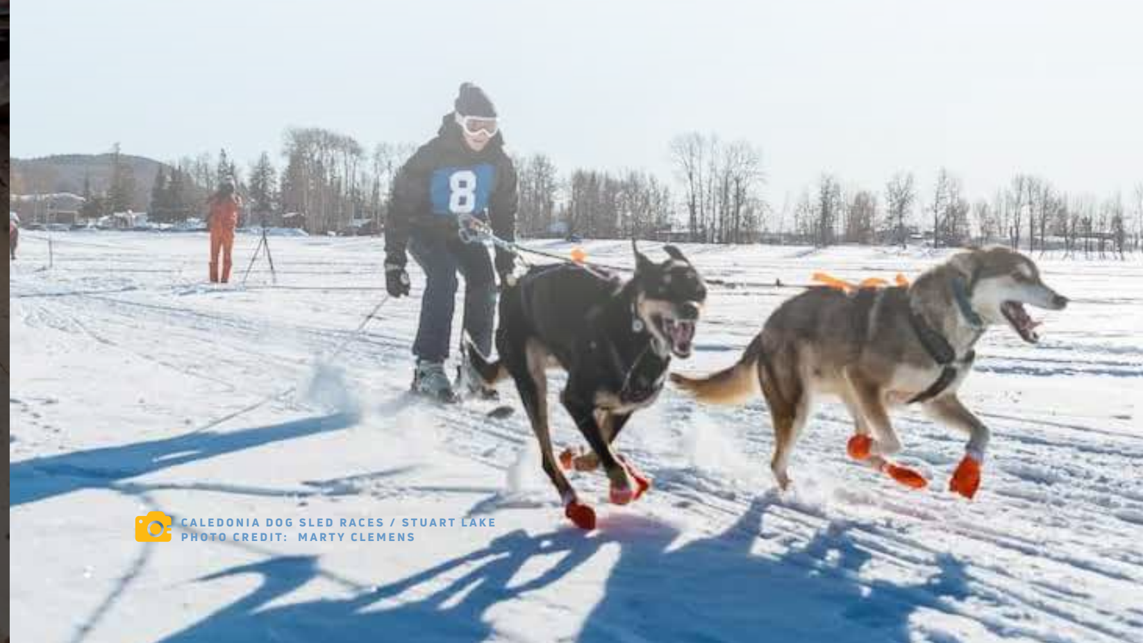
CALEDONIA DOG SLED RACES / STUART LAKE

The Caledonia Classic Dog Sled Races take place every year in February and welcome mushers and dogs from all over North America! We have sprint, long distance, skijor, and youth events with food and fun for the whole family.